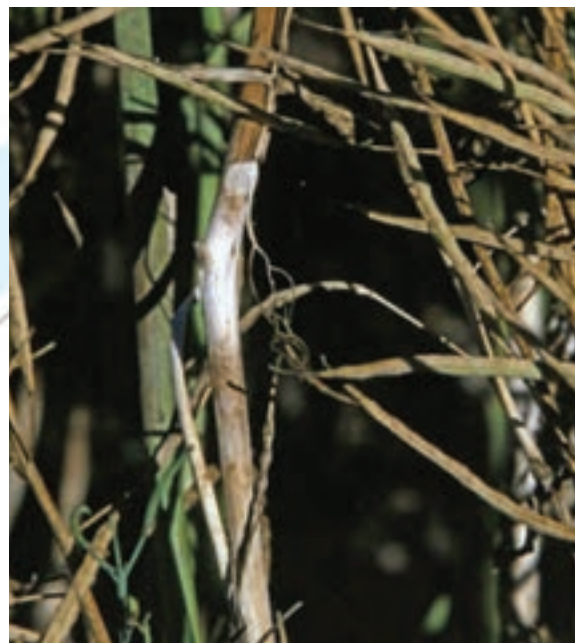
Sclerotinia on stem at harvest time.

For infested fields, think back to the risk profile in the field when you were making the fungicide decision. If you didn't spray, what made you decide not to spray? If you did spray and Sclerotinia infection rates are still high, at what stage did you spray? At what rate? What were the conditions? (Some fungicides lose efficacy if sprayed above 25°C.) Answers to these questions will help with the spray decision next year.