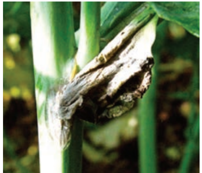
Sclerotinia infection on stem. With humidity in the canopy, this will continue to grow until the whole stem is dead.