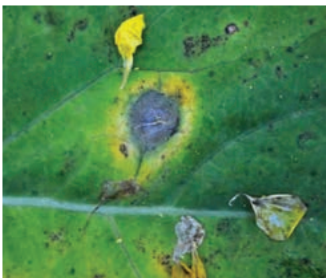
A late application may stop subsequent infection, but infection that is already present can spread from plant to plant within the canopy, likely making this late application ineffective.