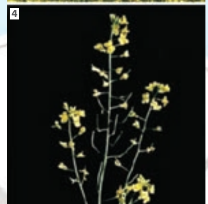
Photos 1 and 2 show canola at 10% bloom. Within a few days, the crop will be at 20% bloom – the earliest stage to spray for Sclerotinia stem rot management. Photos 3 and 4 show 50% bloom.