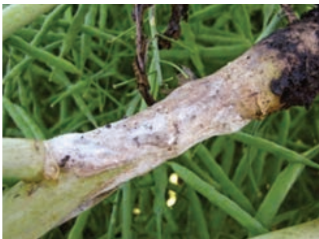
Sclerotinia stem rot at the base of a canola stem.