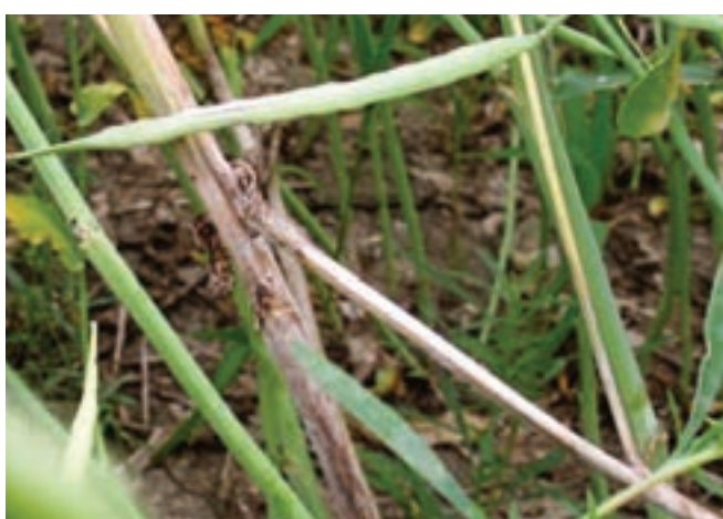
Sclerotinia stem rot can spread from stem to stem when infected stems touch healthy stems. That is why the disease can be worse in lodged crop.