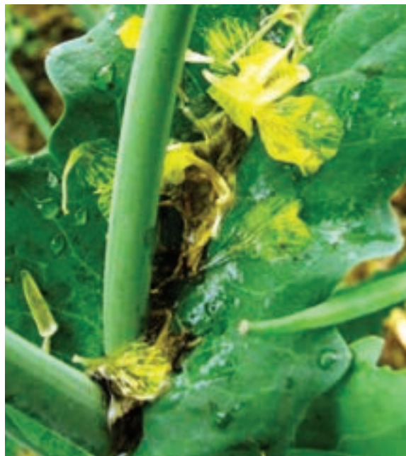
With ample moisture evident in this canopy, these petals fallen near the main stem will likely lead to Sclerotinia infection unless they have been sprayed.

In general, growers cannot bank on wider row spacing and low seeding rates to reduce risk. Any risk reduction from these strategies requires the weather conditions to cooperate. If winds move dry air through the canopy and keep the crop dry for much of the day, then a more open canopy may be beneficial. However, if wet conditions predominate throughout flowering, then any risk reduction will be minimal. Once plants are infected, a few hours of hot and dry conditions each afternoon may stop the pathogen for a short part of the day, but it will restart again in the evening with cool humid conditions.