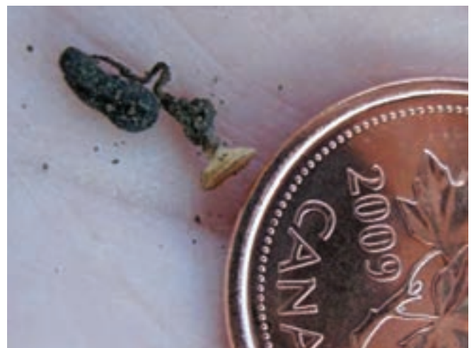
Sclerotinia apothecia are quite small.