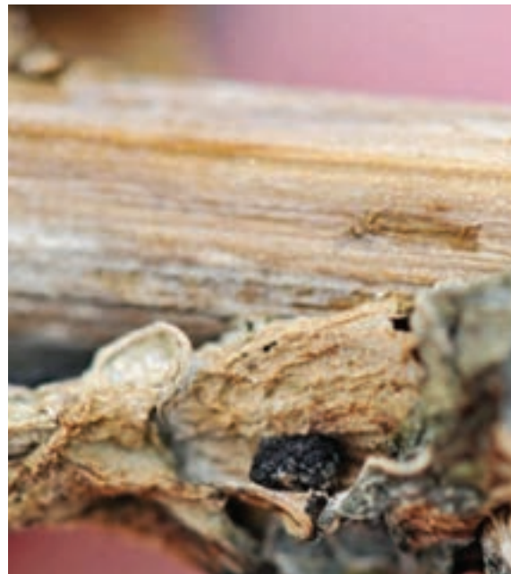
Sclerotia resting body, the small black orb, on a severely infected stem. With moisture and warm weather, these sclerotia germinate the following summer to each form up to 15 apothecia.

If a region had been dry for a couple of weeks leading up to flowering, had one large rainstorm, then turned dry again, one big rainfall event will not increase the Sclerotinia risk much. However, if that one big rainfall event is followed with high humidity and lots of dew (wet legs every morning you