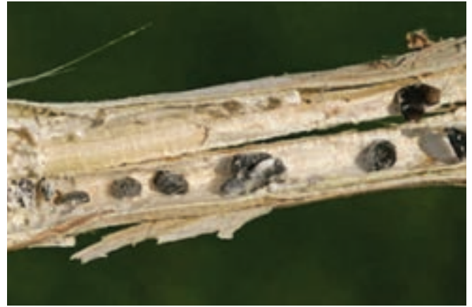
Sclerotia inside the stem.