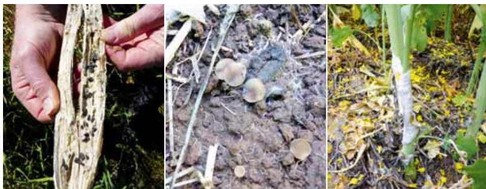
Photo 1: Sclerotia form inside the stems of canola plants and can become mixed with harvested canola seed, as well as being incorporated into crop stubbles and soil.