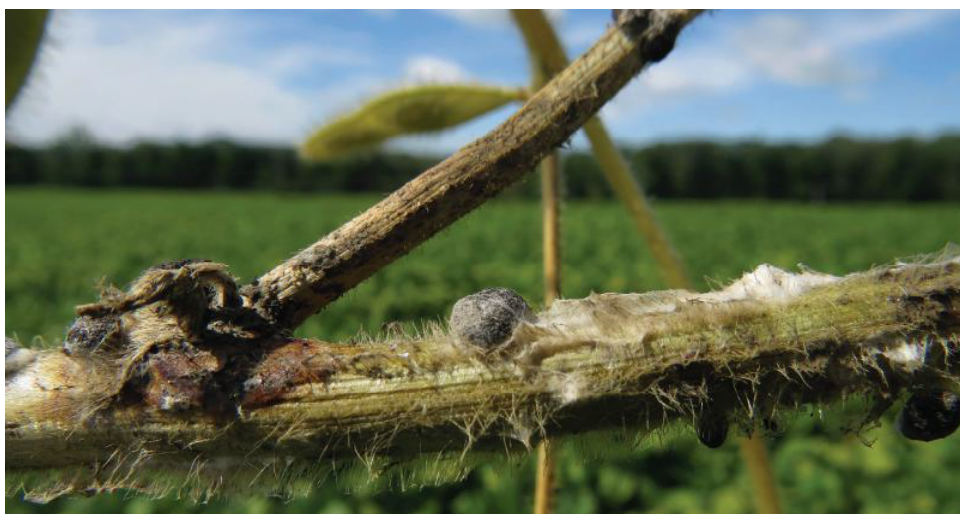
Sclerotinia sclerotiorum on soya beans.

One study area that has benefitted from the availability of genome sequences is research into the reproductive strategies of fungal pathogens. The sexual process in fungi is controlled by genes present at a